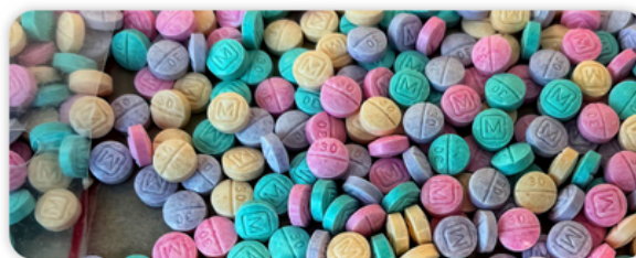
*FAKE rainbow oxycodone M30 tablets containing fentanyl